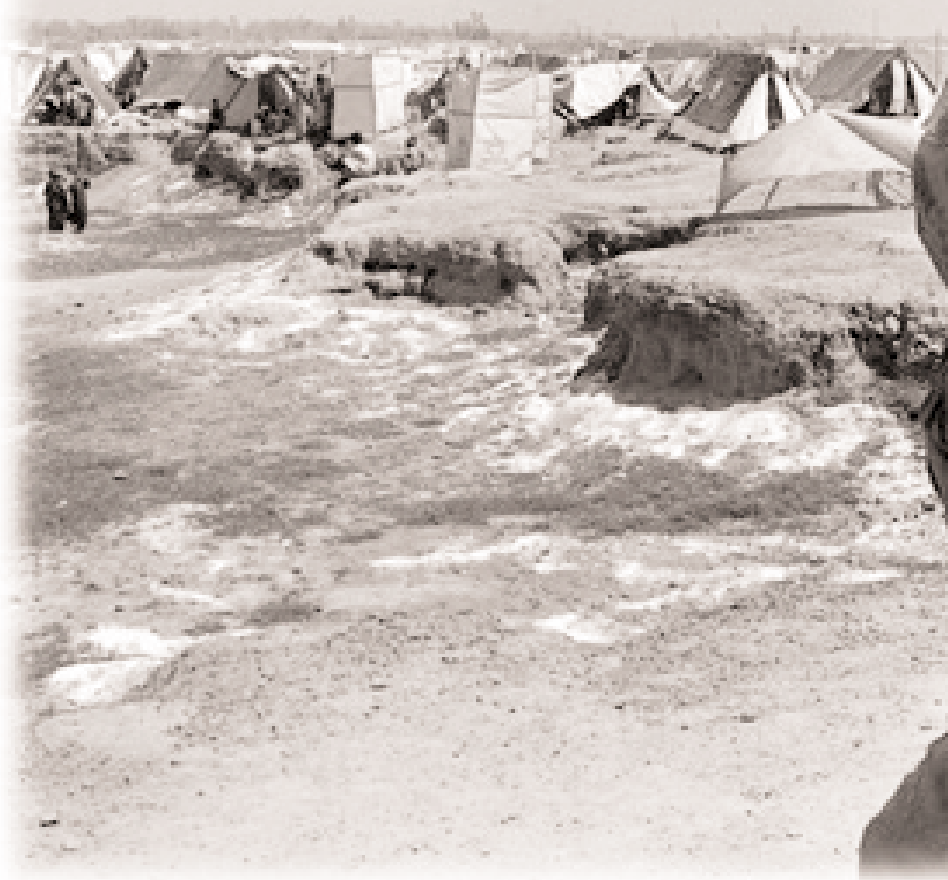
Afghan refugees in Jalozai camp.

As a result of the difficult socio-economic situation aggravated by social and sectarian tensions, and serious security concerns linked to the evolution of the conflict in Afghanistan, the Government of Pakistan has dramatically altered its long-standing policy towards refugees. Presently, the Government is calling for the establishment of camps inside Afghanistan to contain population displacement, and considers the new